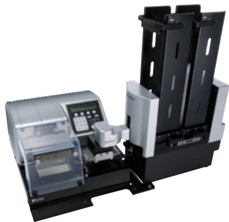
405LS interfaces with BioStack for automated multiple plate processing.