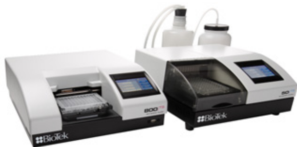
BioTek's 50™ TS Washer is ideal for pairing with 800 TS for routine workflows.