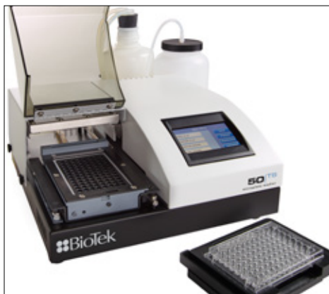
Wash filter-bottom plates and magnetic bead assays with available modules.