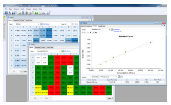
800 TS can be controlled by Gen5 software for extensive data analysis.

The 800 TS Absorbance Reader is an affordable, high quality microplate reader for assays in 6- to 384-well formats. The color touchscreen provides a visual user interface, making programming simple. The onboard software includes "quick read" and custom protocols, with data viewed immediately after measure, followed by export to USB or to the compact printer. The software stores a history of programmed assays and recent plate readings for instant recall. The 800 TS can be configured to include temperature control and shaking, ideal for assays like short- or long-term kinetics, enabled under computer control via Gen5 Software. The 800 TS, used alongside the 50 TS Washer, makes an affordable system to automate many application workflows, including immunoassays, cytotoxicity, enzyme assays, cell-based assays and more.