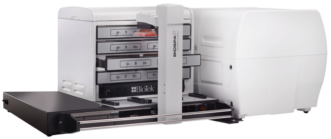
BioSpa 8 transfers microplates from its incubator to Cytation.

The system provides temperature, gas and humidity control for up to 8 microplates for short and long term assays. BioSpa's software seamlessly integrates and schedules liquid handling, incubation, imaging and data analysis while providing constant monitoring of all environmental conditions and processing steps. BioSpa's OnDemand mode provides a simple, efficient interface for imaging or detection-only workflows with multi-user flexibility. The BioSpa System brings increased productivity at an affordable price to many laboratories.