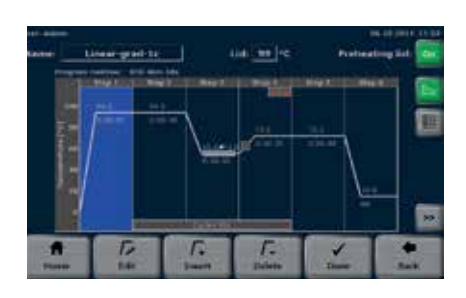
Graphical programming interface

Users are always on the safe side: On a regular basis or based on individual need, an extended self-test can be carried out to check all relevant features such as cooler, heating, cooling rates and more. All results are stored in a report and can be shared with the technical service.