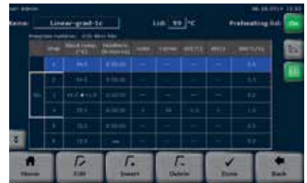
Spreadsheat programming interface

All fields for the input of program parameters are shown in one single screen. One touch leads from the easy spreadsheet to the alternative graphical programming mode.