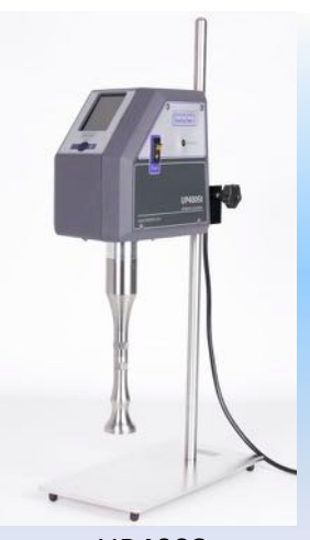
UP400St 400 W powerful ultrasonicator